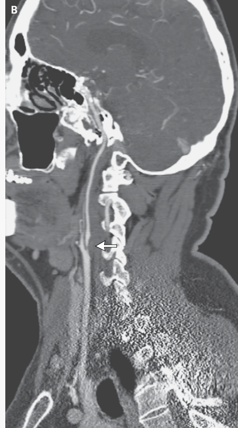
Figure 1. Imaging Studies in a Woman with an Ischemic Stroke.

In Panel A, a diffusion-weighted MRI scan shows an acute infarction in the territory of the left middle cerebral artery. In Panel B, CTA shows severe stenosis of the left internal carotid artery (arrow).